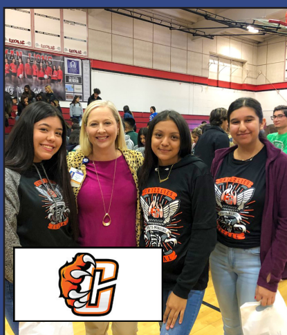
Central High School Sports Medicine ROP Students