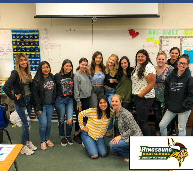
Kingsburg High School CNA Class