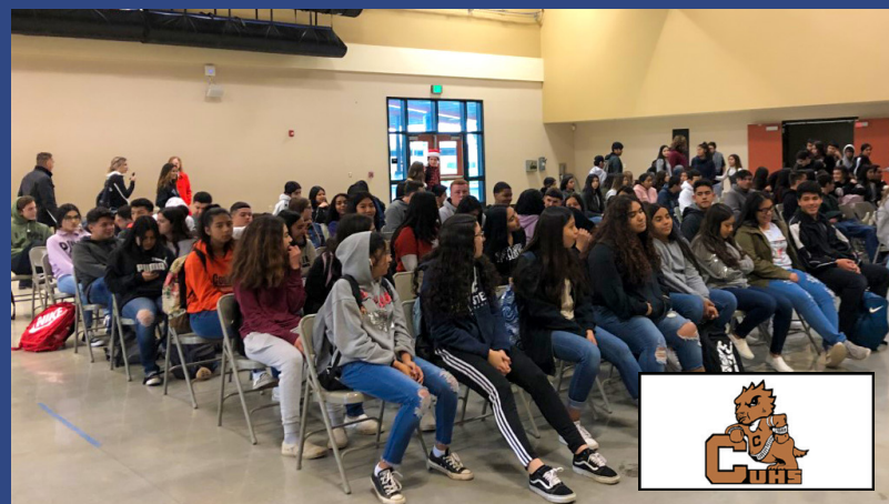
Coalinga High School ROP Students