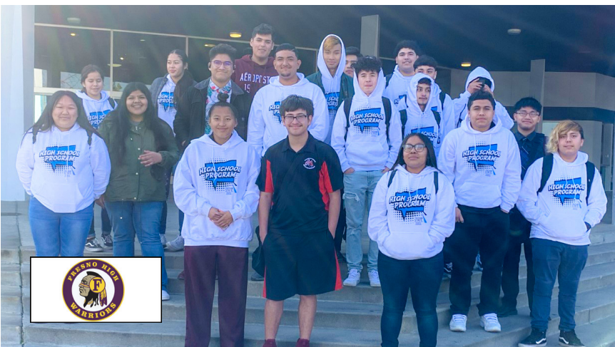
Fresno High School Students